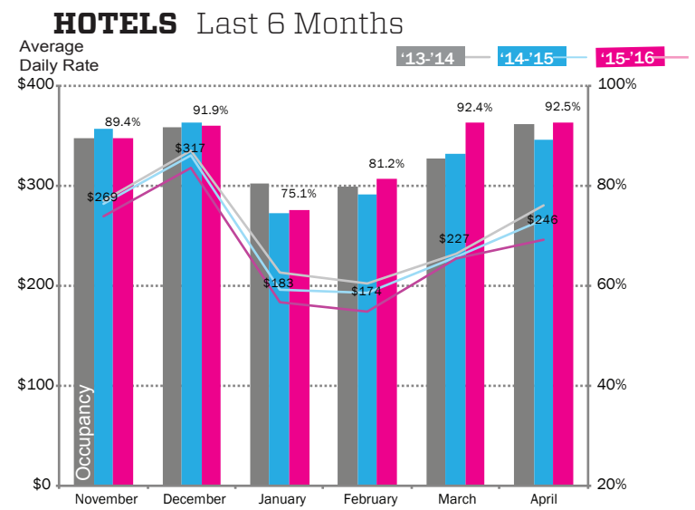
Hotel occupancy in April 2016 was the highest since December and has slightly surpassed occupancy rates in April of previous years.