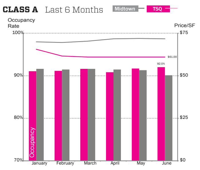
Times Square's share of Class A office space maintains high occupany, while equivalent Midtown spaces are slightly lower. Average asking rates have plateaued at $61/SF.